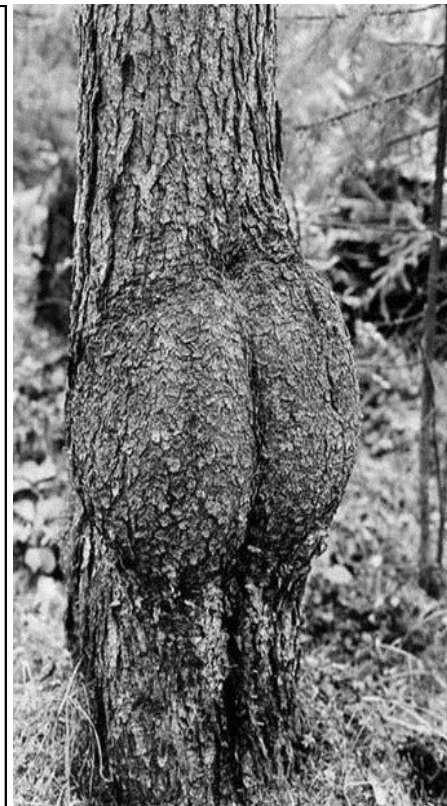
Pine Cone Pete, Says "Too much junk in the trunk"!

Belknap, Camp Whitsett, Camp Wilderness, Coy Flat, Deer Creek Tract, Durrwood Resort Frost Meadow, G.T.W. Packtrain, Holev Meadow, Leavis Flat, Lloyd Meadow Camps I through 5 Long Meadow, Lower Coffee Camp, Lower Peppermint, McIntyre Tract, Pyle's Camp Quaker Meadow Camp, Quaking Aspen, Redwood Meadow, Soda Springs Tract, Spear Creek Tract Thompson Camp, Upper Coffee Camp, Upper Peppermint, White River, White River Tract, Wishon